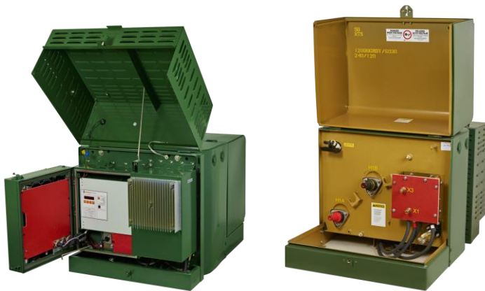
PRT-50 = power regulator + transformer

Implement a simple CVR program or combine local multi-function power control with existing VVO systems to enhance energy efficiency, peak reduction and grid optimization